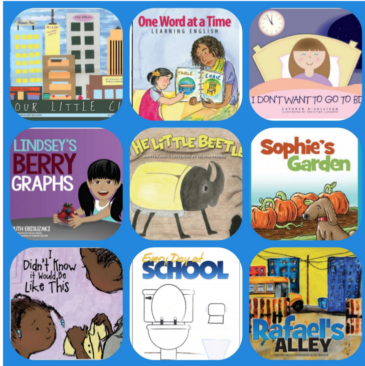
100 Published Titles