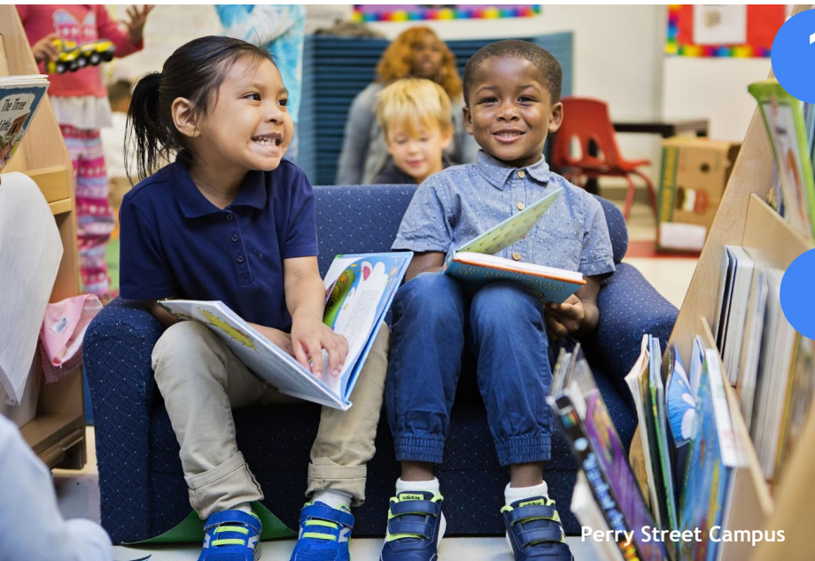
Perry Street Campus

AppleTree's mission is to erase achievement gaps so children will enter kindergarten ready to thrive.